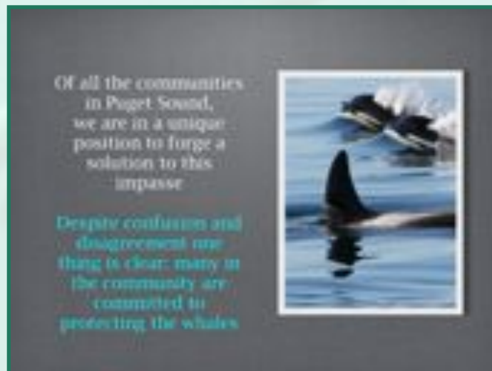
Slide from the MRC's Report and Recommendations on NOAA's Proposed Vessel Rule to Protect Puget Sound Killer Whales

The marine areas around the San Juan Islands contain the majority of the rockfish habitat in the Puget Sound. Utilizing local research and the informed opinions of local fishers and others, the MRC developed policy recommendations for protecting and restoring local rockfish populations. The Washington Department of Fish and Wildlife