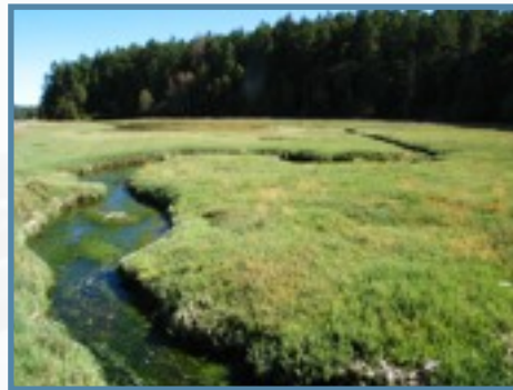
Manage upland and nearshore activities to reduce harm to marine habitat and water quality