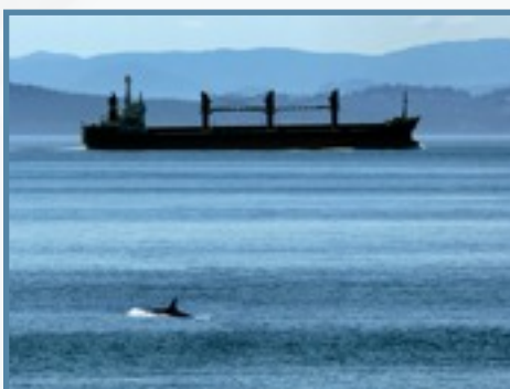
Reduce the risk of large oil spills to San Juan County waters