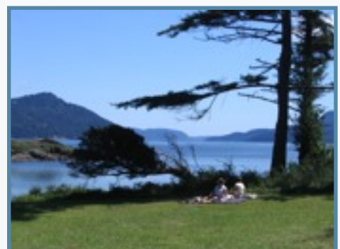
Preserve and manage public access to shorelines and marine views, coupled with a strong stewardship message and compatible behavior expectations