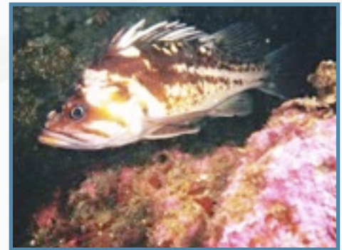
Recover rockfish populations