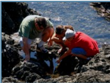
Foster a marine stewardship ethic in residents and visitors