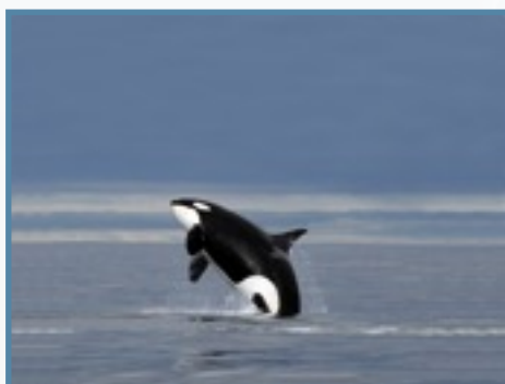
Reduce bioaccumulative toxins in the marine environment